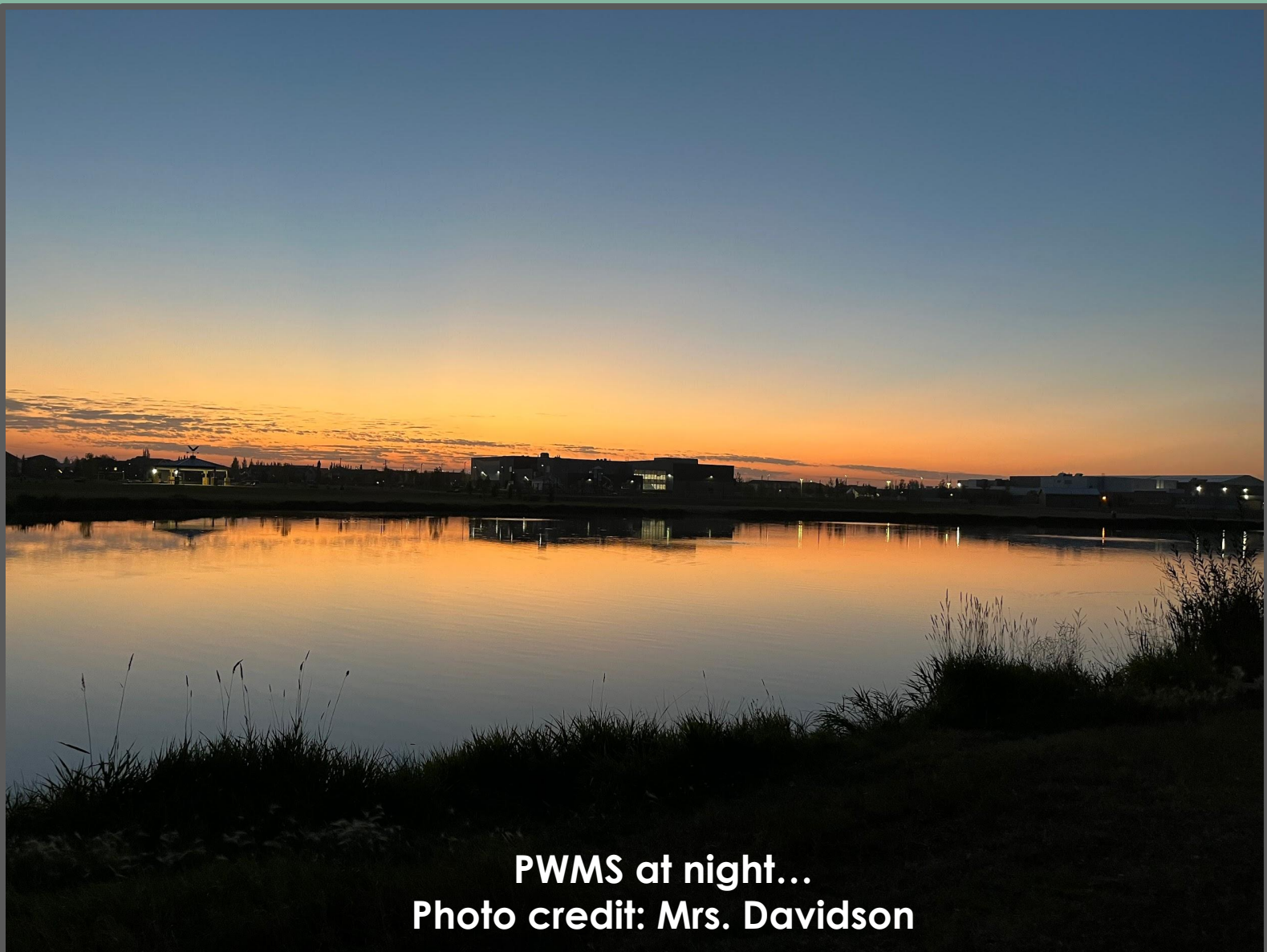
PWMS at night...